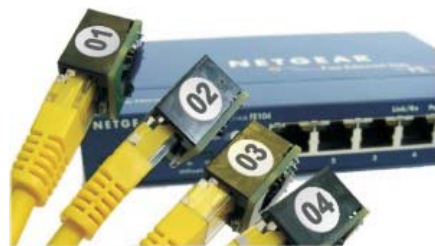
Identify multiple cable runs with the optional identified terminators